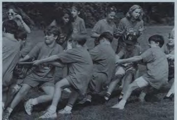
Blues cheer on their teammates at Blue/White Field Day. The intramural competitions are still as fiercely contested as those that started at PCD.