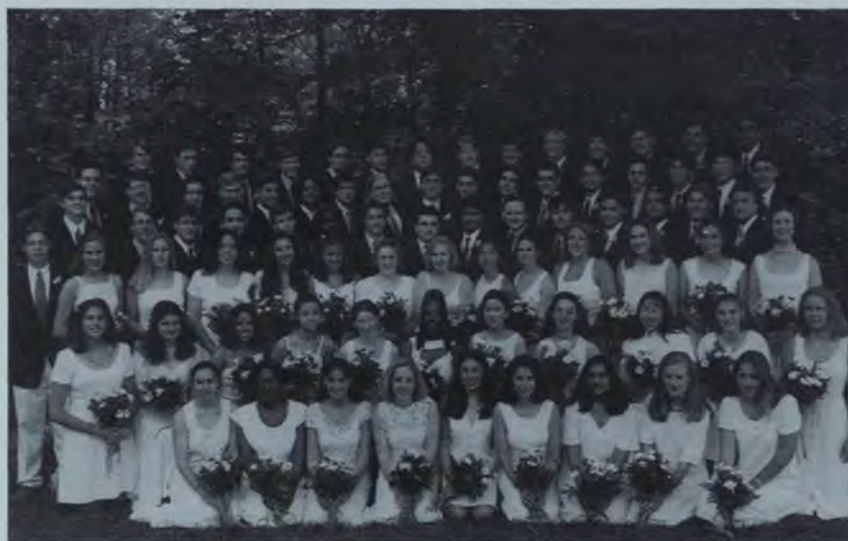
The Class of 1995.