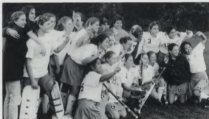
Girls interscholastic teams, led by a very athletic senior class, shone throughout the fall. Field hockey (14-2-0) had a fantastic season that included victories over local rivals Stuart and Lawrenceville. The team went on to win the Prep A State Championship (above) in a beautifully played and highly skilled game against Blair Academy. Girls soccer (15-3-4) played a grueling schedule that comprised some of the top teams in the state. PDS, formerly in the Prep B division, elected to play in the more competitive Prep A State Tournament where, having beaten Lawrenceville in a hard fought, rain drenched semi-final match, it lost to top-ranked Peddie in a closely contested final game, 2-1. The tennis team, although rebuilding, enjoyed a solid season with 8 wins, 4 losses.